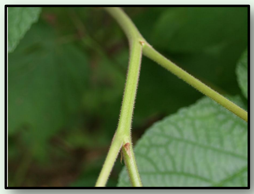
Stems are thorn-less

Flowering raspberry is a member of the rose family. The plant can grow up to 6 feet in height. Flowering raspberry is often found along woodland edges and in low-lying thickets. The leaves are similar to wild raspberry leaves only larger (sometimes as large as 10 inches across). The flowers which bloom between the months of June and August, can be mistaken for swamp rose flowers. After blooming the plant produces large raspberry like fruit which are dry and tasteless. Flowering raspberry can be found along the Maple and White Pine trails.