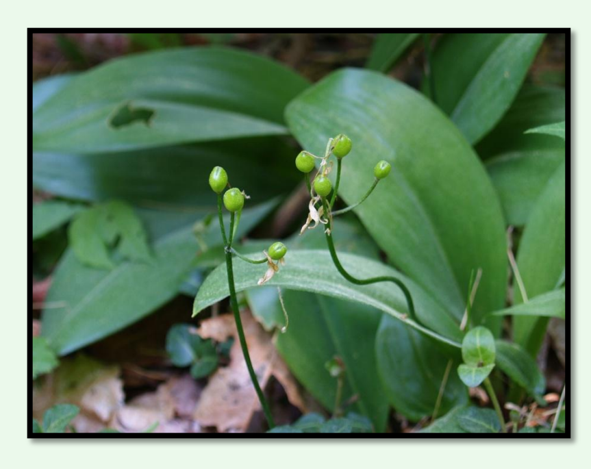
Early stage of Blue-bead Berries

Common in rich moist acidic soils the Blue bead Lily will often grow in dense clusters, where the soil conditions are right. The plants grow to be 8" to 12" tall and produce a long, narrow stalk that bears a cluster of ¾" wide yellow flowers. The blossoms resemble lemoncolored lilies in miniature form. Once the flowers are pollinated the small blue berries that give the plant its common name begin to form. The berries ripen to a deep blue in mid-July and are inedible. Blue-bead Lily can be found along the Hemlock Trail