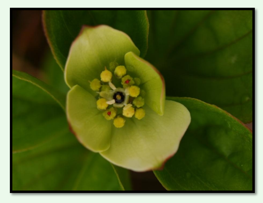
Newly opened Bunchberry Blossom

Bunchberry is actually a dwarf shrub of the dogwood family. It grows in moist woods usually under conifers and reaches 8" in height. The plant has 6 broadly oval leaves(non-flowering plants have 4) arranged in a whorl around a short stalk that bears a single flower head made up of 4 greenish white bracts, in the center is a cluster of greenish yellow flowers. The flowers bloom in late spring to early summer. Once pollinated the cluster of bright red berries that give the plant its common name develop. The berries ripen in mid to late summer. Bunchberry can be found along the Maple Trail.