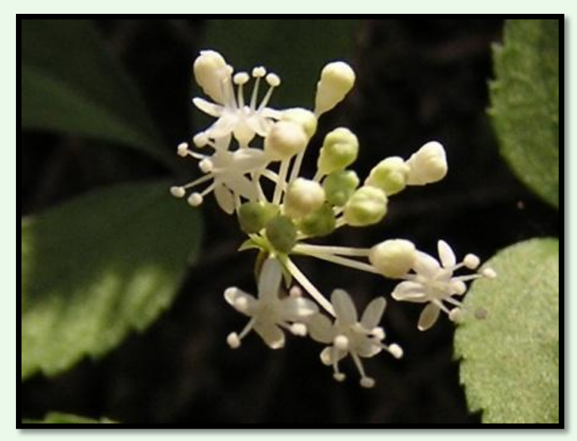
Un-opened buds & Flowers