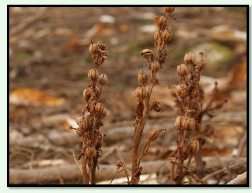
Pinesap seed cases

Pinesap is a relative of Indian pipe, and shares many of the same characteristics. Pinesap is also a myco-heterotroph and has no chlorophyll or leaves. The flower stalks turn upright once they are pollinated and the seed cases form. Like Indian pipe, the seed cases persist though winter and are easy to spot poking through the leaf litter. One of the main differences between Indian pipe and Pinesap is that Pinesap produces multiple flowers per stalk, while Indian pipe only produces one. Flower color is another difference. Summer blooming flowers are yellow and fall blooming flowers tend to be reddish in color. Pinesap blooms between June and October. The flowers grow 4" to 15" tall. Pinesap can be found along the Hemlock Trail.