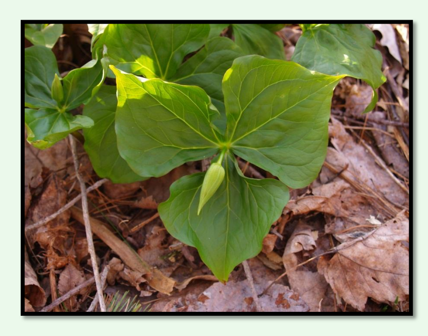
Leaves and un-opened buds

Purple Trillium, also known as Wake-robin or Stinking Benjamin is a stunning member of the lily family. Purple Trillium is one of the first flowers to appear in the spring and the aroma of the flowers smells like rotten meat hence the name Stinking Benjamin. Purple Trillium grows to be 7-16" tall and is pollinated by flies. It can have white, yellow or green flowers. Purple Trillium can be found along the Hemlock trail.