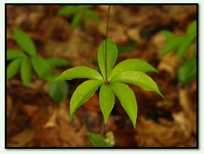
Lower leaves of flowering plant