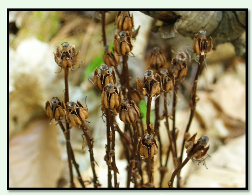
Previous seasons seed cases

Indian pipe, sometimes called corpse flower is a myco-heterotroph, meaning it gets its nutrients from a symbiotic relationship with fungus in the soil. Indian pipe is unusual because it has no chlorophyll and produces no leaves so it cannot produce its own food. Indian pipe can be found growing in clumps or as a single flower. Indian pipe blooms between June and September. The flowers grow as high as 10 inches and are white and waxy. Once pollinated the flowers begin to turn upright and shed its petals revealing the seed case. The seed cases persist though winter and can give an indication of where to look for Indian pipe the next season. Indian pipe can be found along the Hemlock Trail.