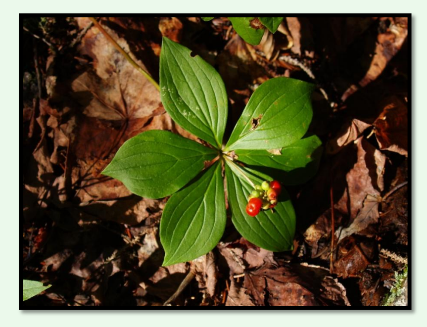
Bunchberry foliage & fruit