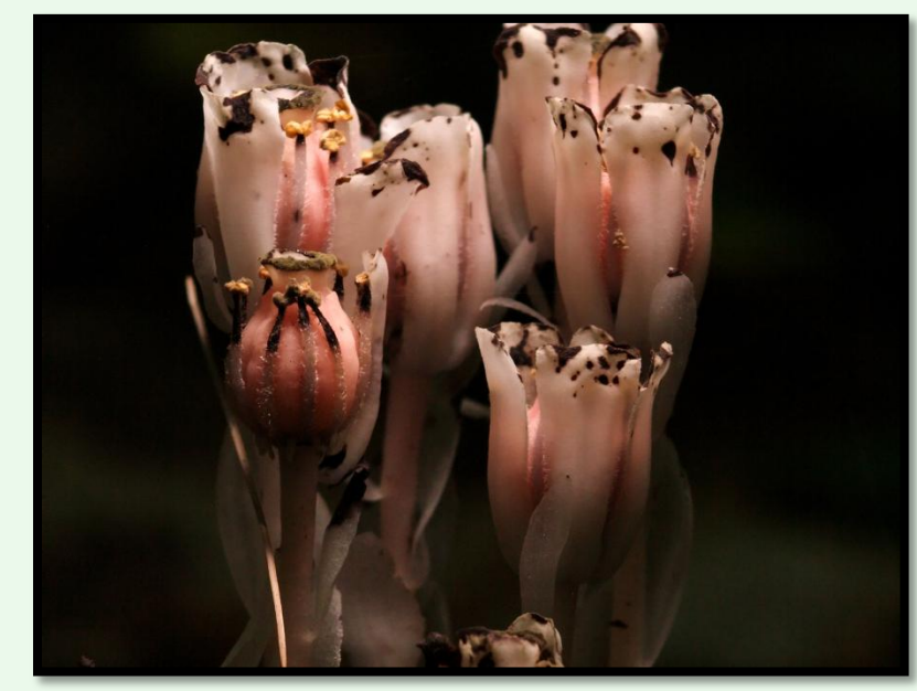
Developing seed cases