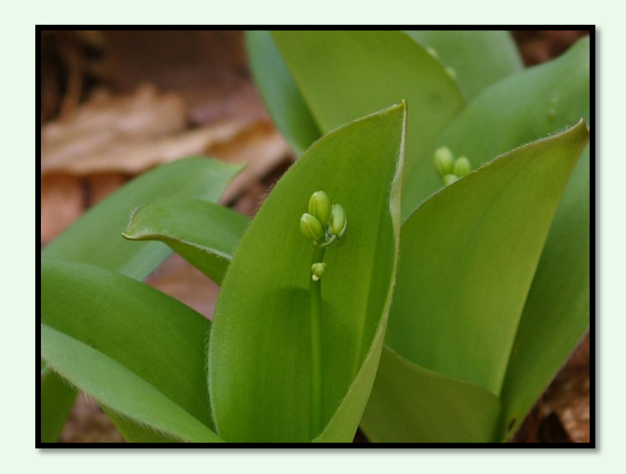
Blue-bead lily buds