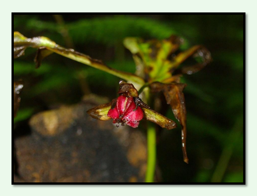
Trillium seed pod