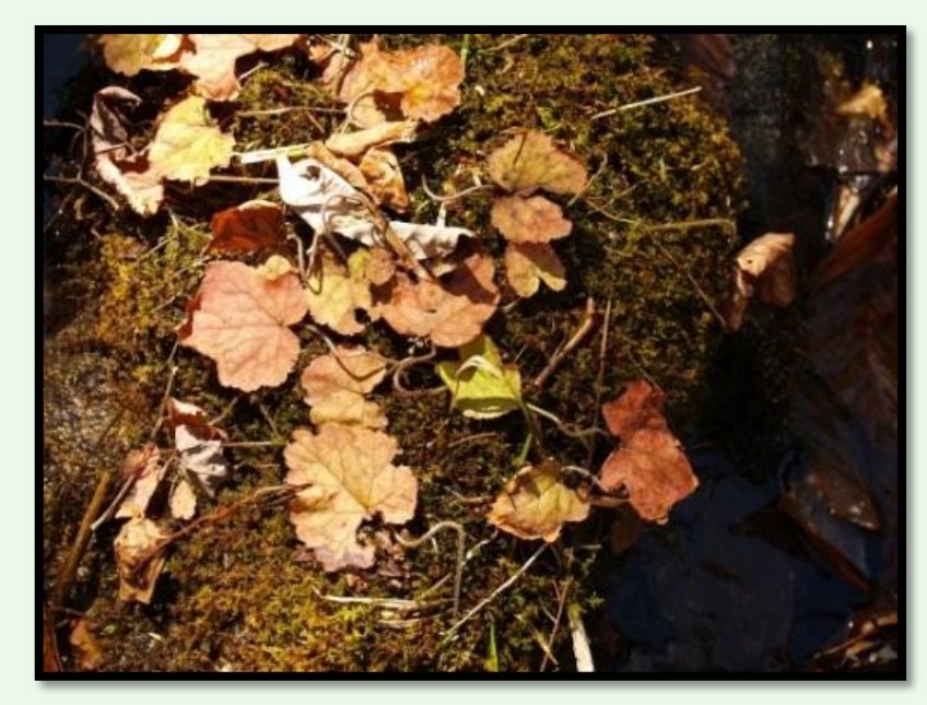
Previous season's leaves