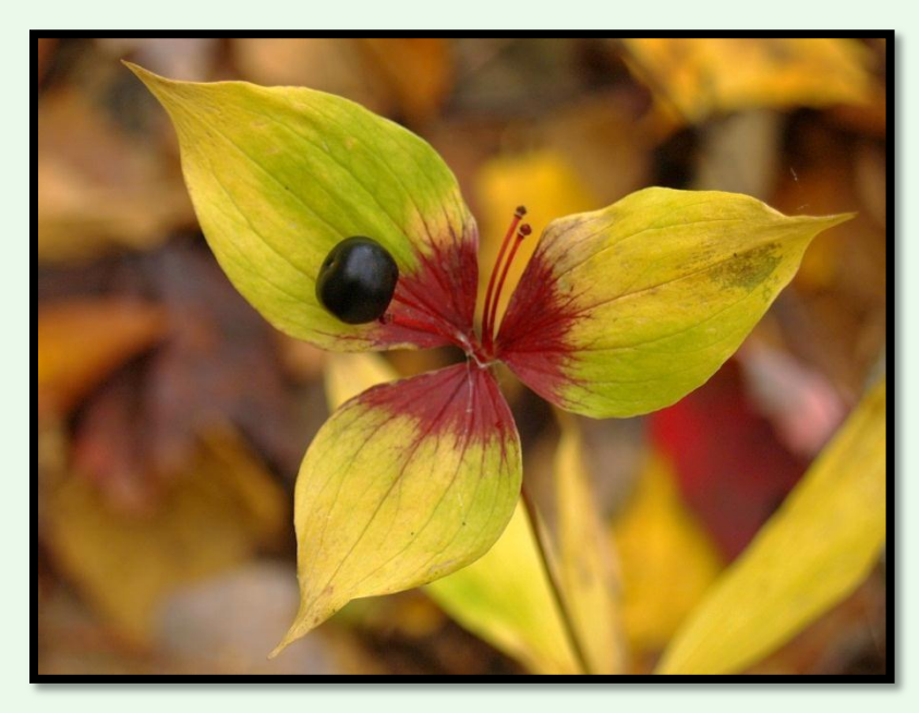
Indian Cucumber Root fruit

Indian cucumber root is a member of the Lily family which grows up to 2' tall. Indian cucumber root is common in transition forests where northern tree species grow alongside tree species from the south. It flowers between May and June. The flowers are greenish-yellow and measure ½" across and resemble larger lilies minus the petals. The plants themselves are easy to identify even when there are no flowers present because of the distinctive arrangement of the leaves. (See inset) Indian Cucumber Root can be found along the Hemlock trail.