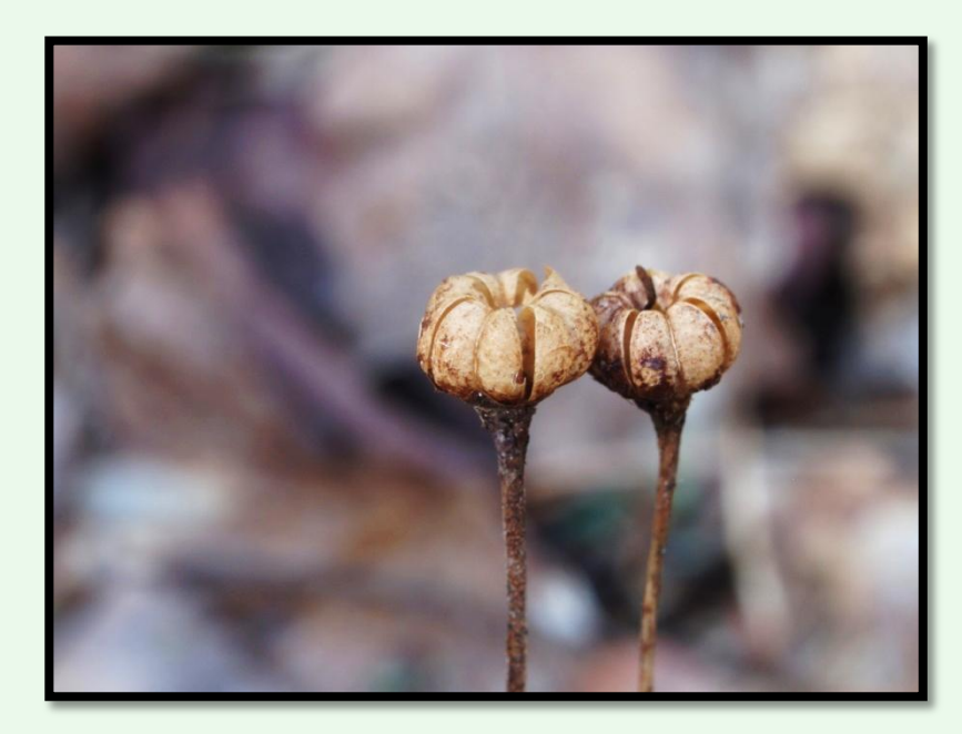
Last years seed pods