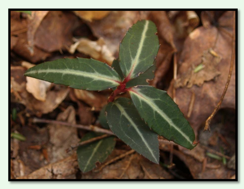
Spotted wintergreen foliage

Spotted Wintergreen is an evergreen and a member of the shinleaf family. The plant grows to a height of 4-10 inches. The leaves are very distinctive and are helpful in identifying this plant. The leaves are narrowly oval, dark green and have a white stripe down the center. The flowers which bloom between the months of June and August are white. Once pollinated the seed pods form and the stems turn upright. Spotted wintergreen is an endangered species in Maine, so please tread carefully near this plant. Spotted wintergreen can be found along the Hemlock trail.