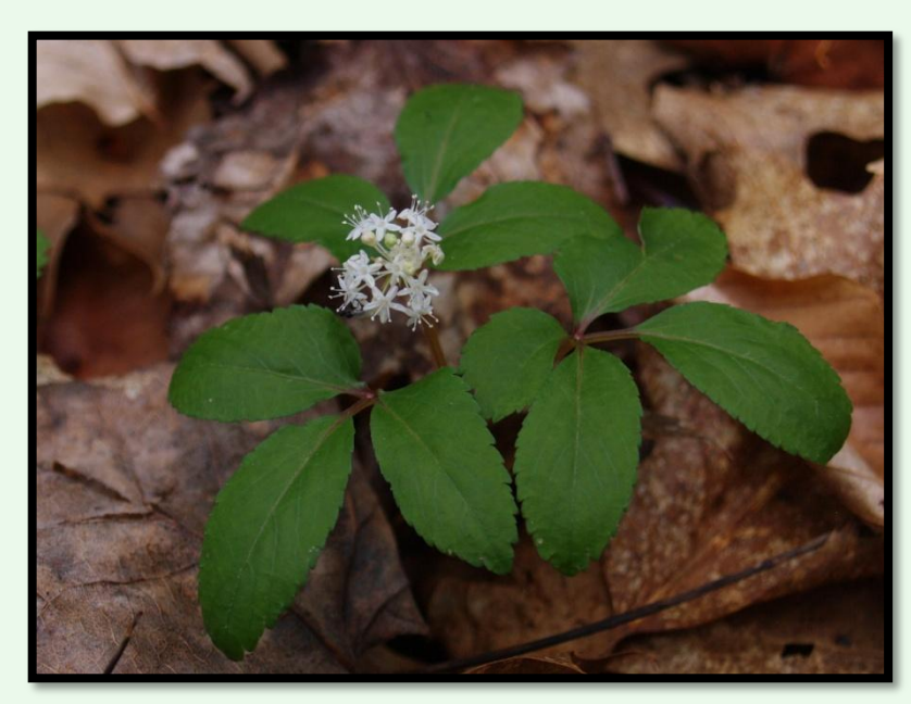
Dwarf Ginseng Foliage

Dwarf Ginseng is closely related to medicinal Ginseng. The plants grow between 3" to 8" high. The flowers, which bloom between April and June, are white and slowly change to a pale pink as they age. Once pollinated the plant begins produce small yellowish berries from July to August. Dwarf Ginseng was used for many different medicinal purposes by the Native Americans. Dwarf Ginseng can be found along the Hemlock Trail.