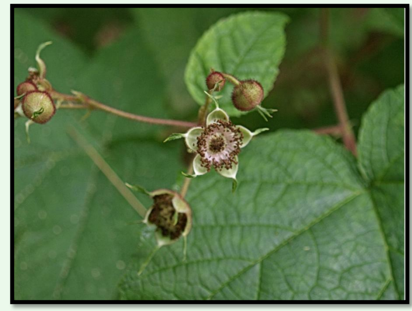
Pollinated flowers and "hips"